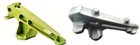
Machined Near Net Forging

Arnprior Aerospace is part of the Aerospace & Specialty Metals Group of Companies (ASMGM)