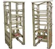
Electronic Bay Racks