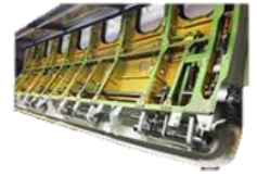
Major Aircraft Structures